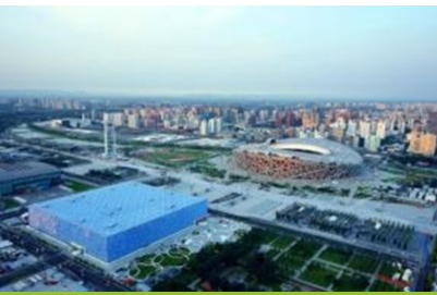
OLYMPIC STADIUM OF BIRD NEST &amp; WATER